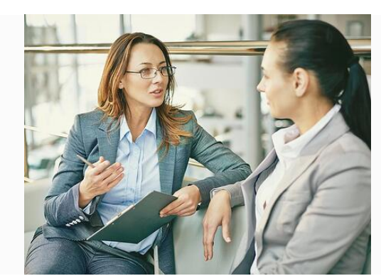
Here is why you should take advantage of your college career center: