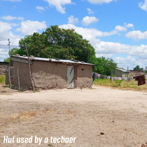
Hut used by a teacher