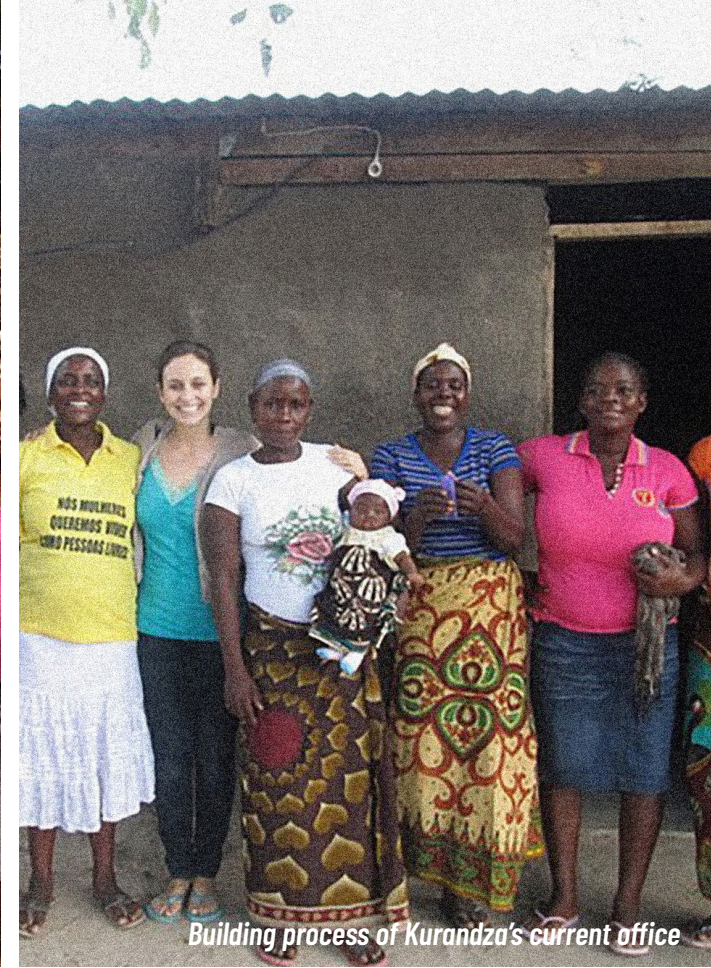
Building process of Kurandza's current office